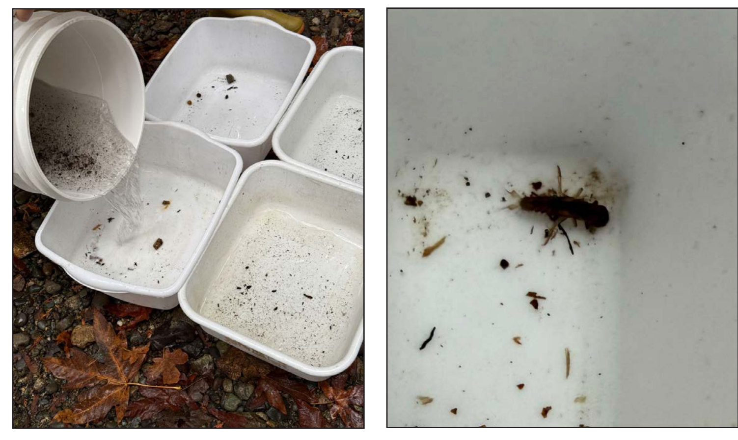
Invertebrate Survey - Page 3

The underside of this pebble has two Caddisfly larvae snuggled in a cleft. When all the pebbles within the sample area down to the chosen depth were hand wiped, the D-net was turned inside out over a collection bucket. The contents were then poured into a series of trays, one for each volunteer. When the critters were spotted (with much difficulty!), they were sucked up with water into a pipette and transfered to ice cube trays where they were counted and identified. The one below is a Caddisfly.