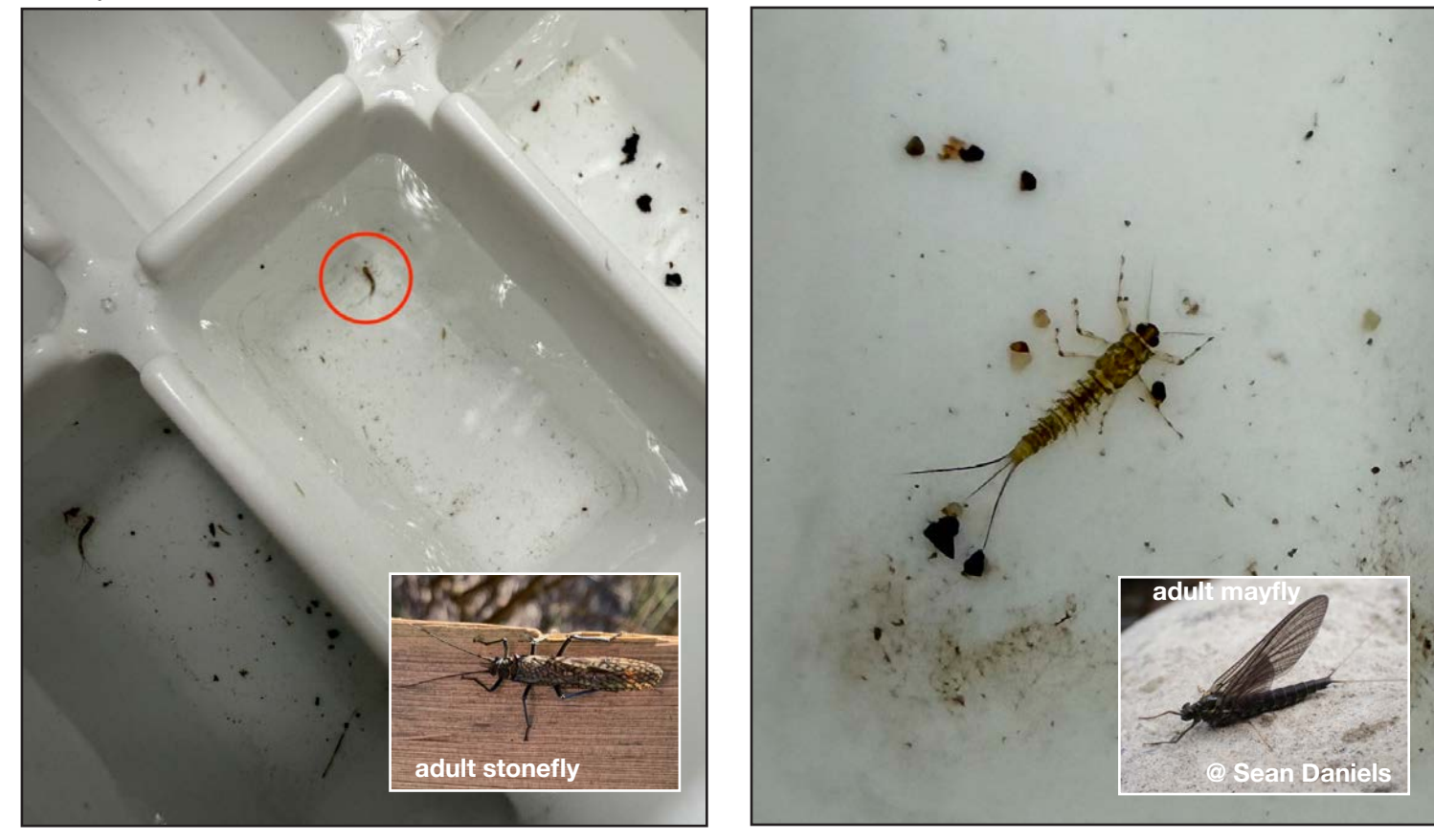
Invertebrate Survey - Page 4

Above, on the left is another species of Caddisfly. Unlike the one on the previous page, this kind doesn't enclose itself in a protective case made of debris. Above, on the right, the larger creature is an aquatic worm. The smaller, light brown one is a Cranefly larva. Below, you can see from the size of the ice cube tray that the critters are very small. The Stonefly larva on the left is the one featured on the front page. It is perhaps 8 mm long. The Mayfly larva on the right is a bit larger. It takes an expert to tell one species of larva from another.